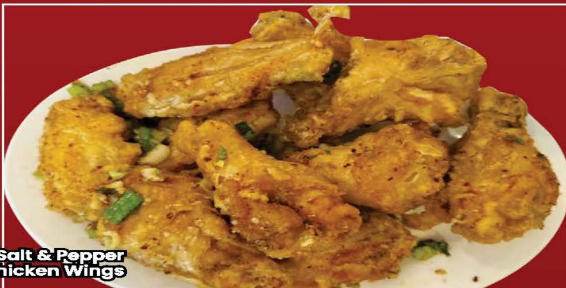
Salt & Pepper Chicken Wings