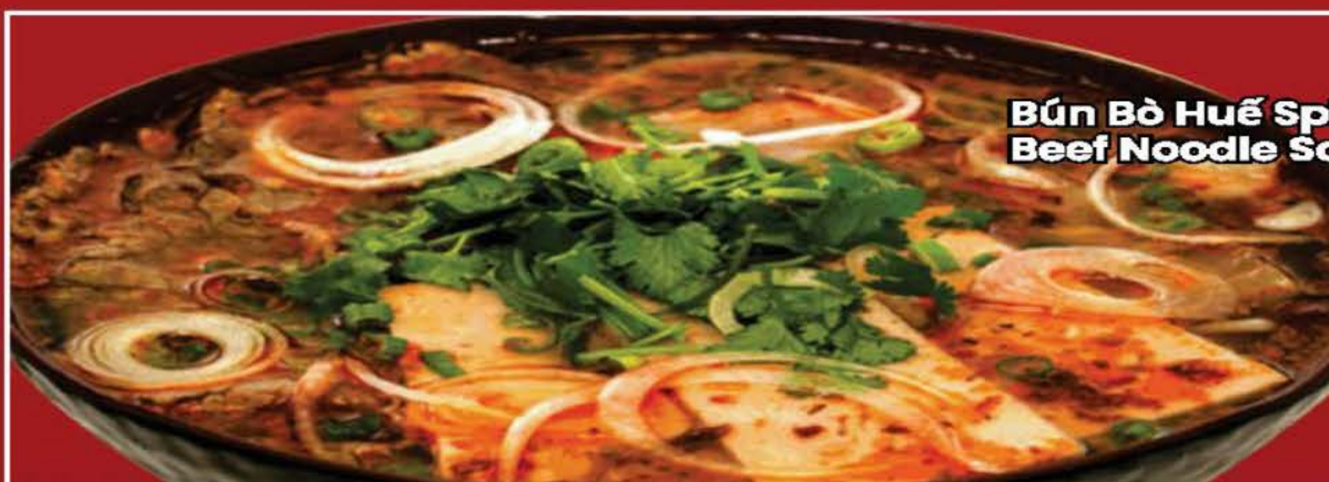
Bún Bò Huế Spicy Beef Noodle Soup

3211 Holiday Court #102 La Jolla, CA 92037