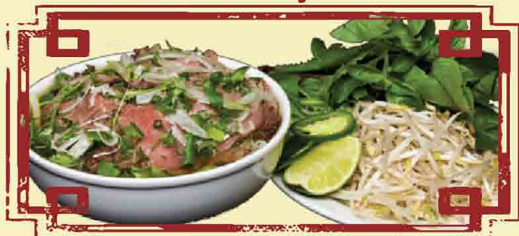
#1 SPECIAL COMBINATION