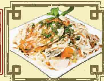
#34 Chicken Salad