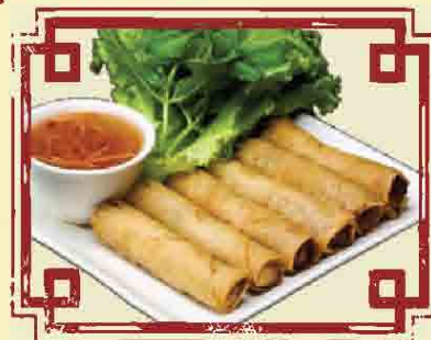
#28 Egg Rolls