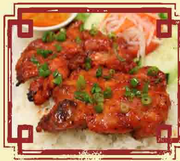
#37 Grilled Pork & Meatloaf